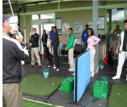
Getting Tips from the Golf Pro

The annual event helps diverse law school students from area colleges and universities learn networking and client development skills—lessons that aren't taught in the classroom. Such networking often takes place on the golf course, where minorities and women often are underrepresented. Participating law school students are paired with Womble Carlyle attorneys and business leaders for an in-person lesson in playing golf and doing business.