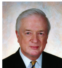
Gov. James B. Hunt, Jr.